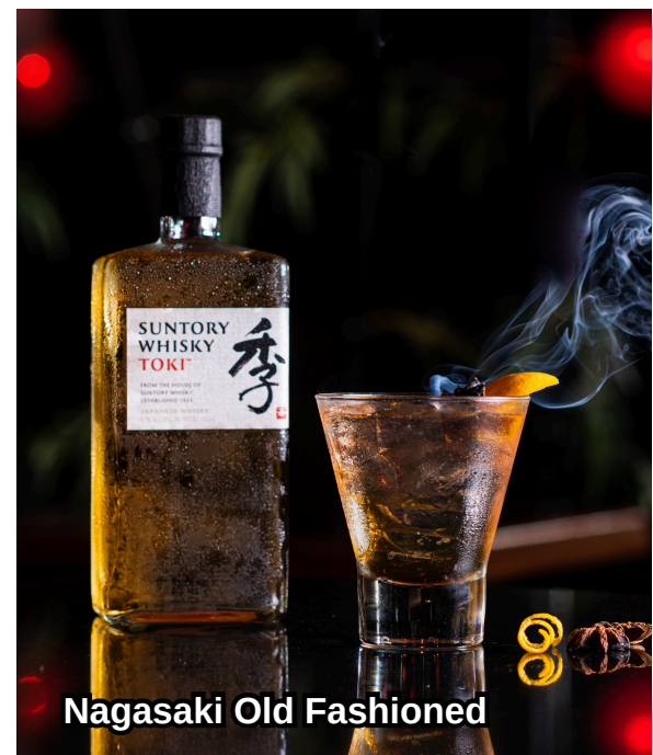
Nagasaki Old Fashioned