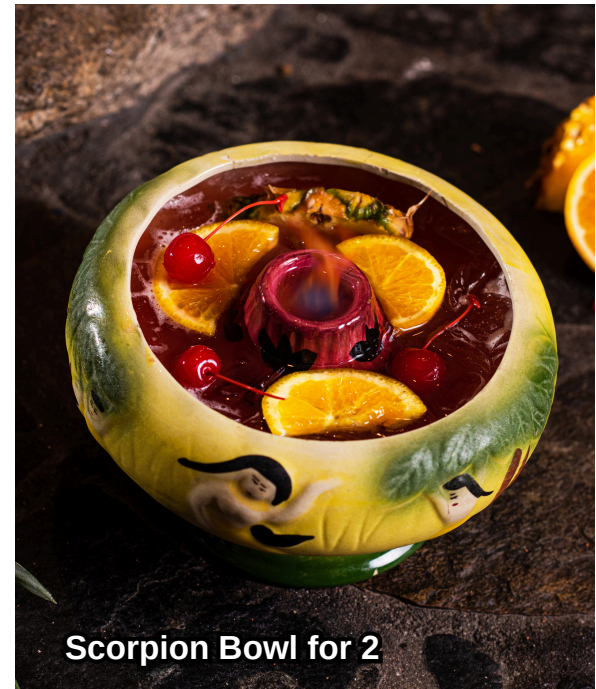
Scorpion Bowl for 2