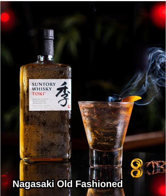
Nagasaki Old Fashioned