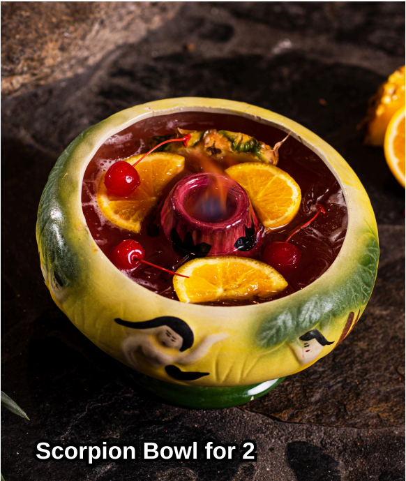
Scorpion Bowl for 2